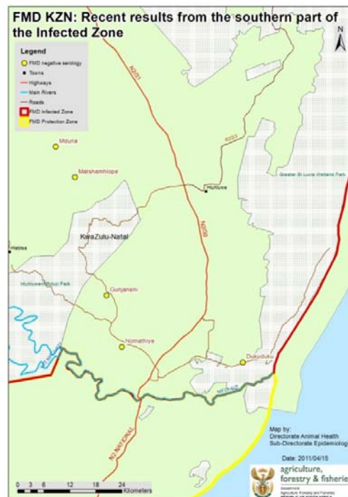
Map 3: Re-sampling in the southern area of the infected zone

Samples taken from the previously positive Nomathiya and Dukuduku diptanks now test negative for FMD on LPB ELISA.