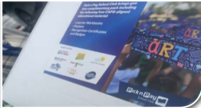
School package delivered by Pick and Pay to the schools during the Evaluation