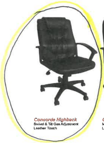
Concorde Highback Swivel & Tilt Gas Adjustment Leather Touch