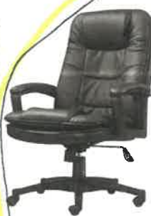
Loreen Highback Swivel & Tilt Gas Adjustment Leather Touch

Swivel & tilt gas adjustable chairs (either of the circled, Black in colour )