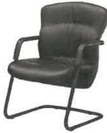
Linette Visitor Metal Sleigh Base