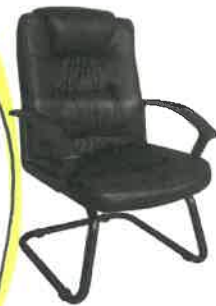
Concorde Medium Back Metal Sleigh Base Leather Touch