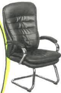
Bella Visitor Chrome Sleigh Base