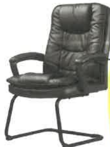
Loreen Visitors Metal Sleigh Base Leather Touch