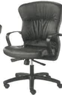
Linette Highback Gas Height Adjustment Back Rest Adjustment